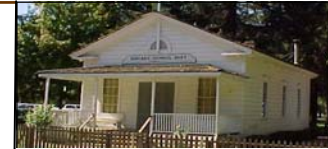
Rhoads School Established 1872

Meet the 2011 Rhoads School Board (Pictured from left to right)