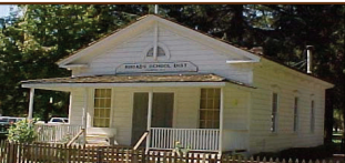
Rhoads School Established 1872