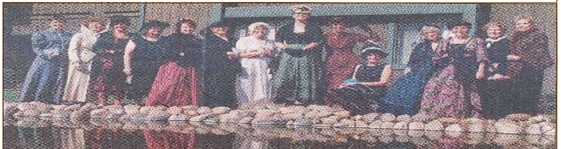
St. Mark's United Methodist Women's "Fashion Memories"

We're also looking for larger recycled baskets to make silent auction gift baskets. If you have any you'd be willing to donate, please bring them to the hotel or call 685-8115 to make other arrangements.