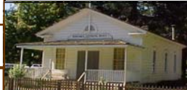
Rhoads School Established 1872