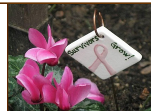
From the Gardeners of the Grove Newsletter, The Scarecrow

In recent times, ribbons have been used to express solidarity with a cause. Pink Ribbons are used to express support for those who are diagnosed with breast cancer.