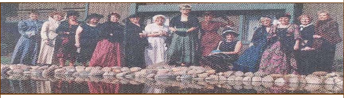
St. Mark's United Methodist Women's "Fashion Memories"

We're also looking for larger recycled baskets to make silent auction gift baskets. If you have any you'd be willing to donate, please bring them to the hotel or call 685-8115 to make other arrangements.