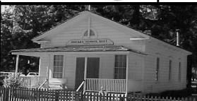
Rhoads School Established 1872