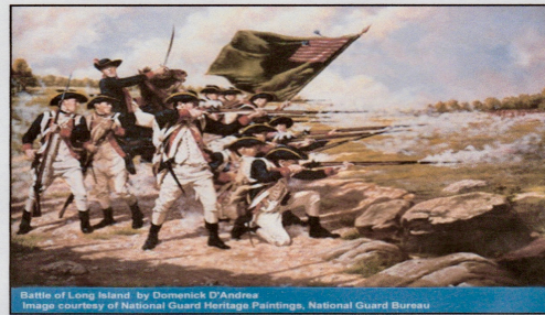
The Delaware Regiment of the Brigade of the American Revolution and the Elk Grove Historical Society Presents