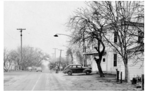
Hotel at Main Street & Stockton Road