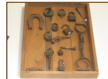
There are 4 antique locks in display cases