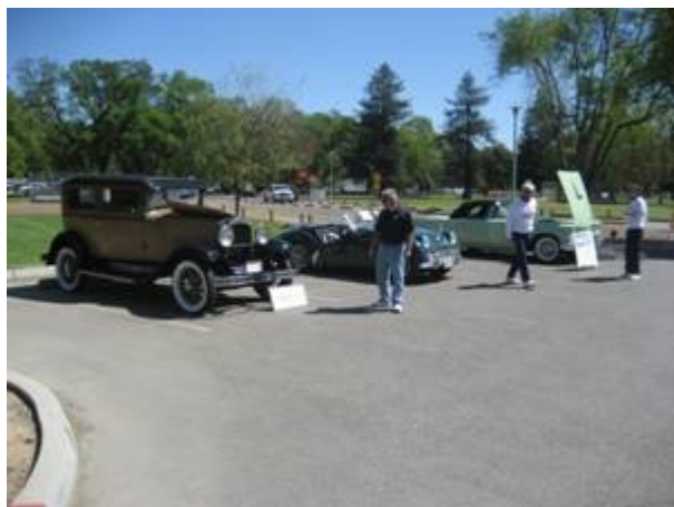
More great cars!