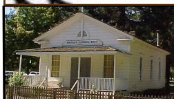
Rhoads School Established 1872

Thank you to all who have donated teacups, saucers and plates. With our annual tea fast approaching, we're still in need of donations of pretty, matching teacups and saucers. We also need 7 inch plates, but they don't need to match the teacups. If you have teacups, saucers and/or plates you'd like to donate, please call 916-685-8115 or e-mail stagesstophotel@aol.com .