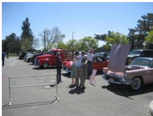
Some of the many beautiful cars on display.