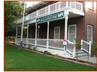
Elk Grove Hotel & Stage Stop Museum Welcoming Visitors Since 1850